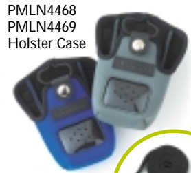
PMLN4468 PMLN4469 Holster Case