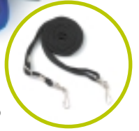
4285820Z01 Light Duty Shoulder Strap