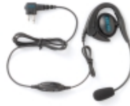
PMLN4444 Boom Mic with Earset PTT/VOX switch